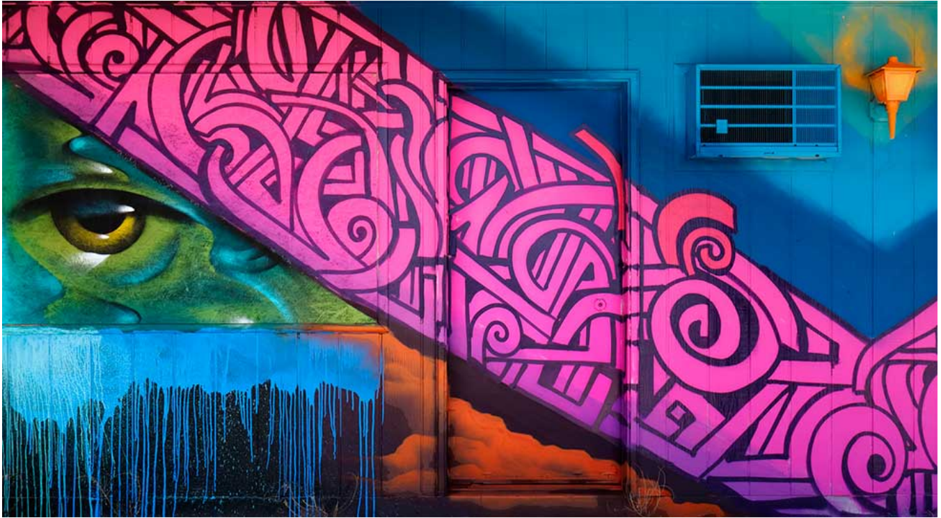
"Anasazi Inn"