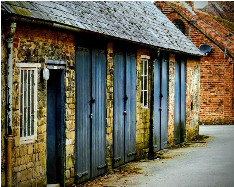
"Barn Doors" by Steve Light