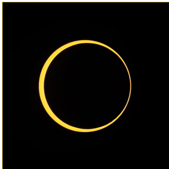
"Ring of Fire" by JP Watson