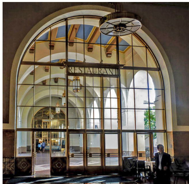
"Union Station" by Steve Light