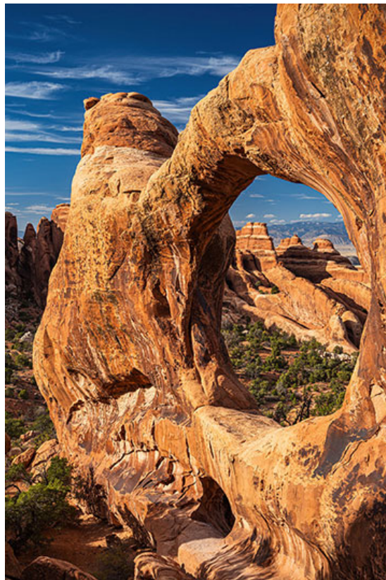
“View of Double O Arch” by Chuck Zamites