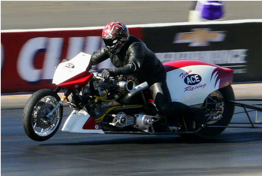
"Lift Off!" by Steve Light