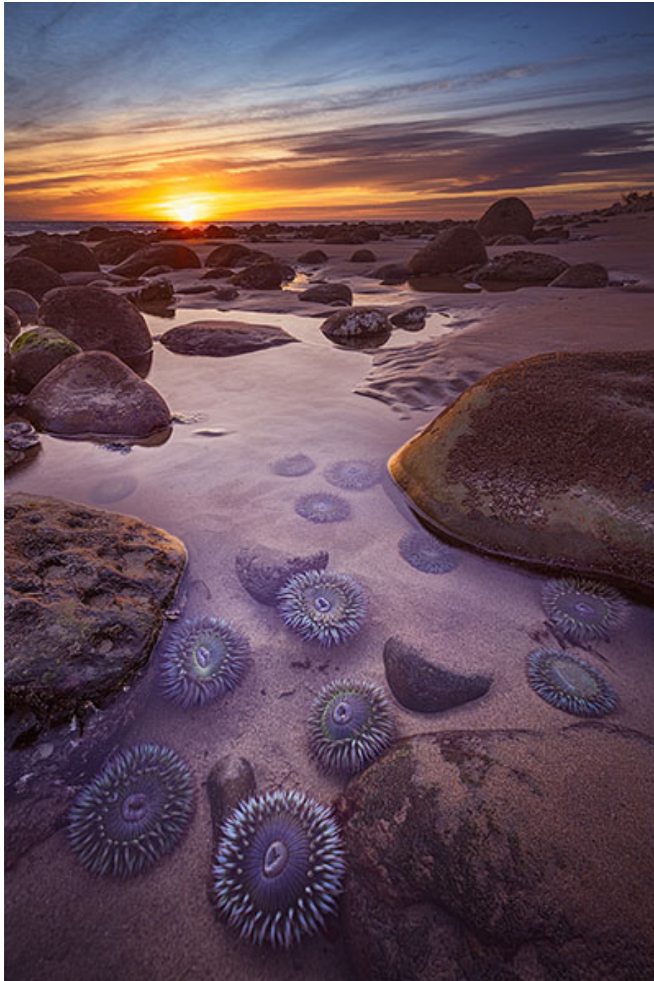
"Anemones At Sunset" by Chuck Zamites