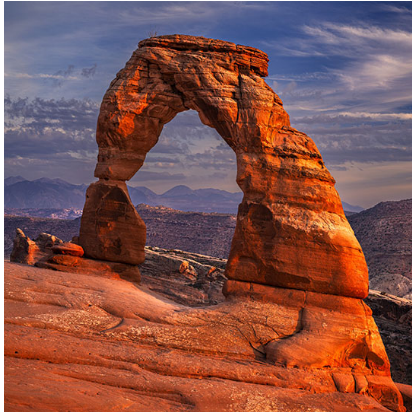
“Dusk at Delicate Arch” by Chuck Zamites