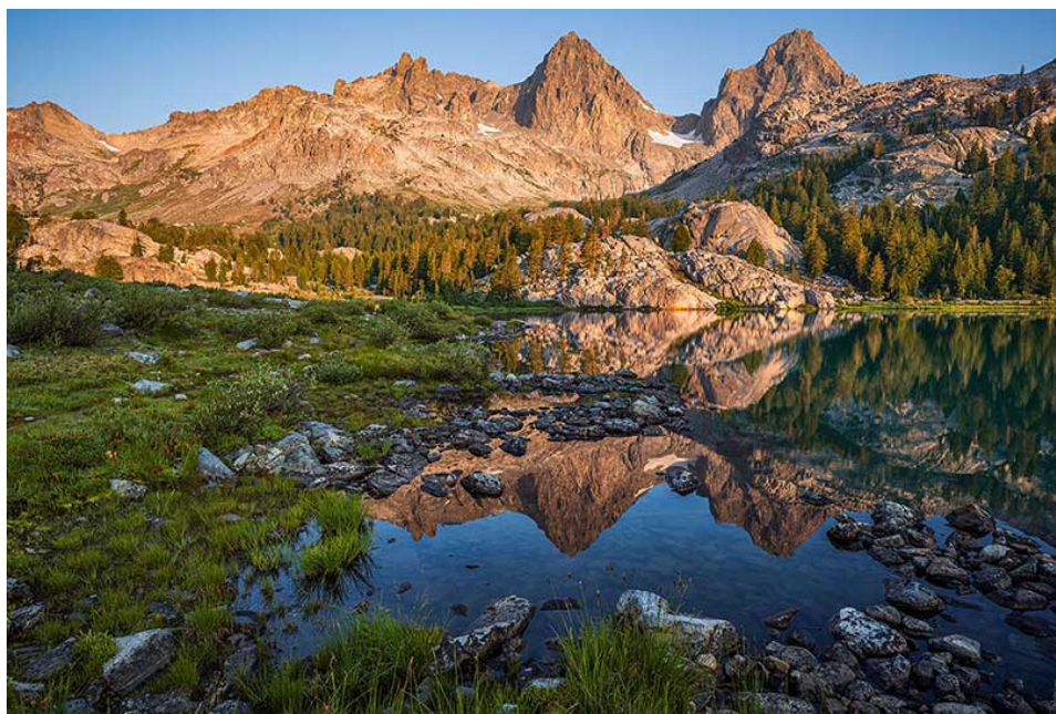
“Morning at Ediza Lake” by Chuck Zamites