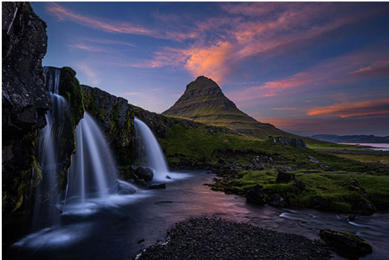
“Evening Color at Kirkjufell” by Chuck Zamites