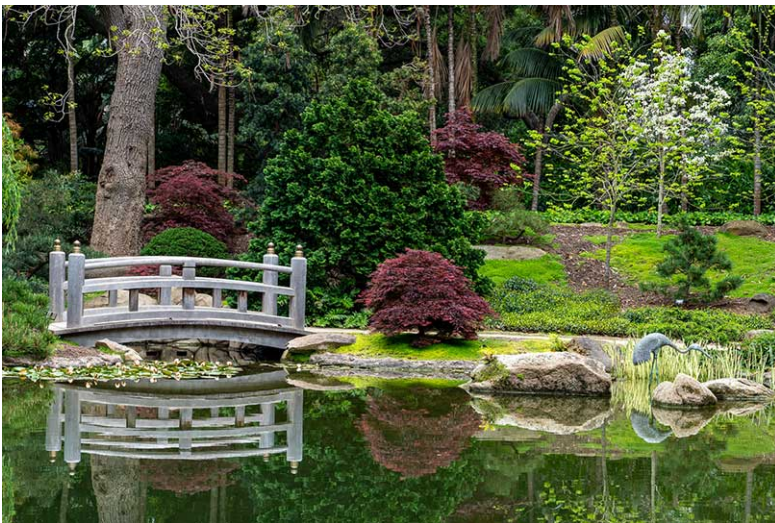
"Lotusland" by Bruce Schoppe