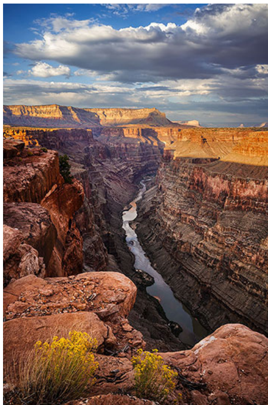
“Scene at Toroweap” by Chuck Zamites