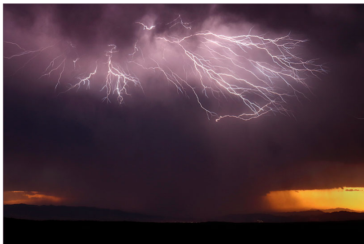
Desert Storm _JP Watson