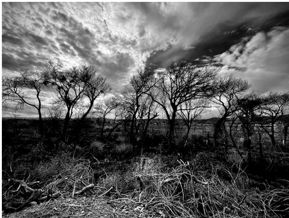
After the Storms _Bill Horstick